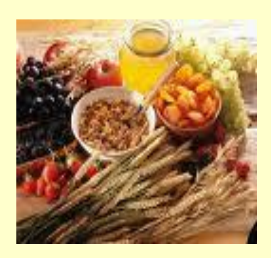
Thanks for your attention