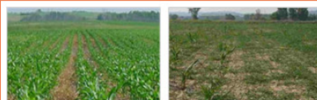
Destruction of maize crops in several EU MS in 2004, due to the use of illegal pesticides with a harmful composition of sulfonylurea derivatives.

The global revenues associated with the trade in counterfeit and other illegal pesticides are estimated at more than 4.4 billion Euros per annum. The illegal trade in pesticides represents over 10 per cent of the total worldwide market, which has an end-user value of 44 billion Euros. To varying degrees, the use of illegal pesticides has been detected across Europe. In North East Europe, a region particularly targeted by the criminal networks involved in this activity, more than 25 per cent of the pesticides in circulation in some European Union (EU) Member States are estimated to originate from the illegal pesticide trade. However, most European countries with a large agricultural sector are affected by this threat.